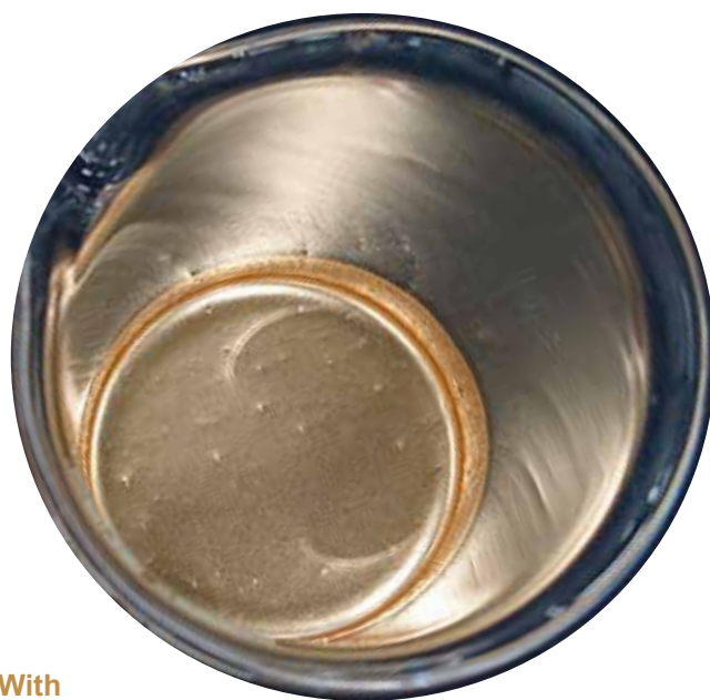
With Anticor™ CBA 63

Two gold-look metallic pigment concentrates prepared with a dissolver; with and without Anticor™ CBA 63. Pictures were taken immediately after dispersing.