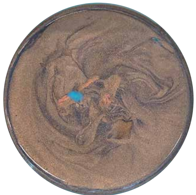
Copper pigment concentrate containing 2% Anticor™ CBA 63, after one month storage.