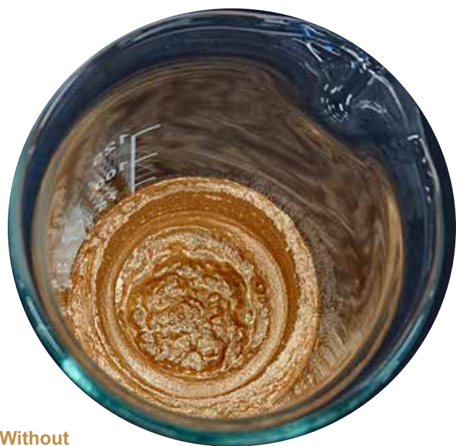
Without Anticor™ CBA 63

Both methods have shown to decrease the dispersing time and improve stability significantly.