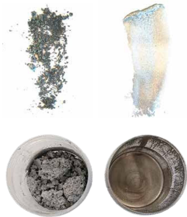
Without Anticor™ CBA 63

Anticor™ CBA 63 inhibits this undesirable reaction by encapsulating each pigment particle, forming a protective water repellent layer.